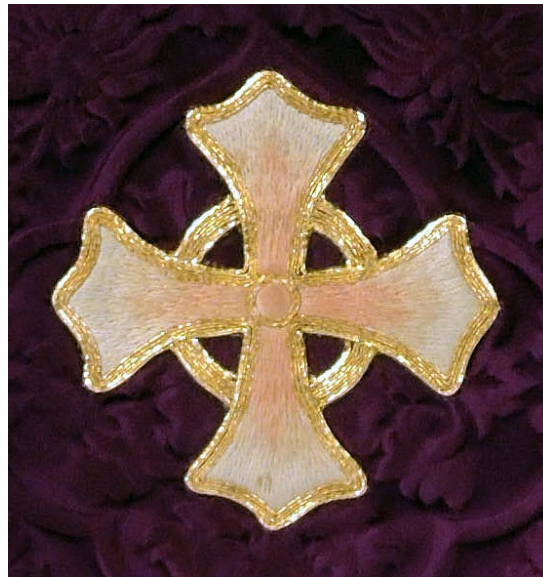
Trinity Parish chalice cover, detail

Please join us for the following Liturgies