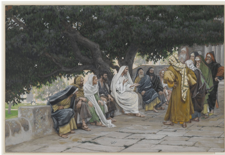
James Tissot, Les pharisiens et les saducéens viennent pour tenter Jésus, 1886–94

"Soundings" Scripture Reflection continues today at 11:00. All are welcome. https://us02web.zoom.us/j/88410778796